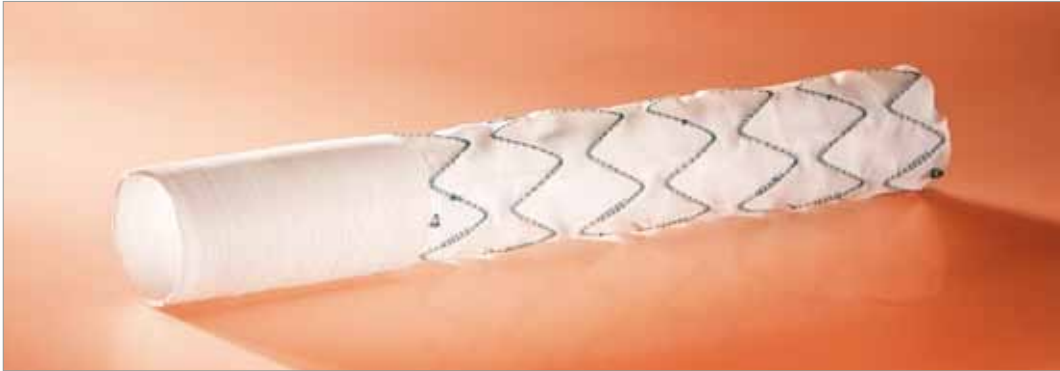
The E-vita open plus hybrid stentgraft prosthesis