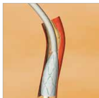
Deployment of the stentgraft part