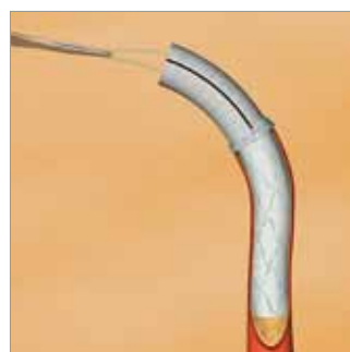
Extraction of the vascular prosthesis (cuff)