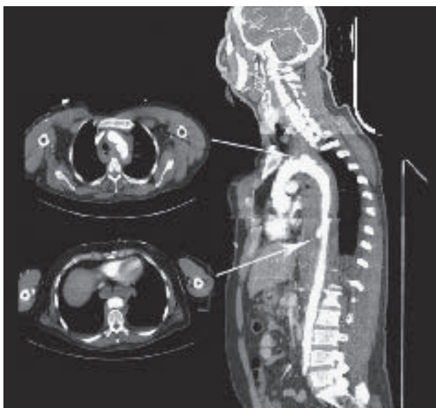
Fig. 1. Double rupture of the thoracic aorta at the isthmus and at the diaphragm in a 46-year-old male patient after a fall from 12 m height, who was transferred in hemodynamically unstable condition. Sagittal CT reconstruction and CT scans on admission to the trauma unit show the contained rupture at the isthmus and disruption at the diaphragm with extensive hematoma in the lower mediastinum.

All procedures were performed by the cardiothoracic surgeon in the operating room with the patient under general